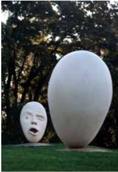
See No Evil/Hear No Evil , Robert Arneson, 1992 Acrylic on bronze. The Fine Arts Collection at UC Davis. Commissioned by the Campus Art in Public Places Workgroup with private funds.