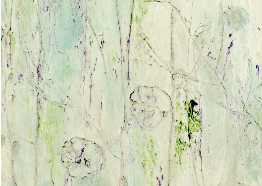
Susan Swartz, detail: Nature Revisited 44 , 2018, Acrylic on canvas, 42x84 in. Private collection.