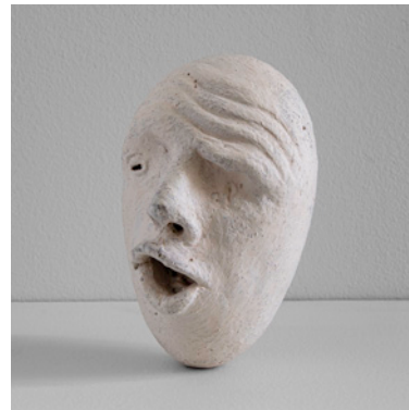
Robert Arneson, Model for “Egghead,” 1991. Glazed ceramic, 5 x 3 x 3 ½ in. Estate of Robert Arneson.