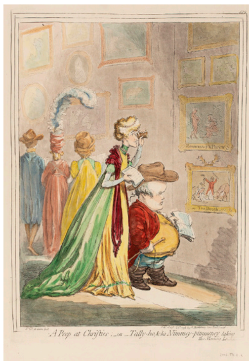
James Gillray, A Peep at Christie's, 1796, hand-colored engraving.