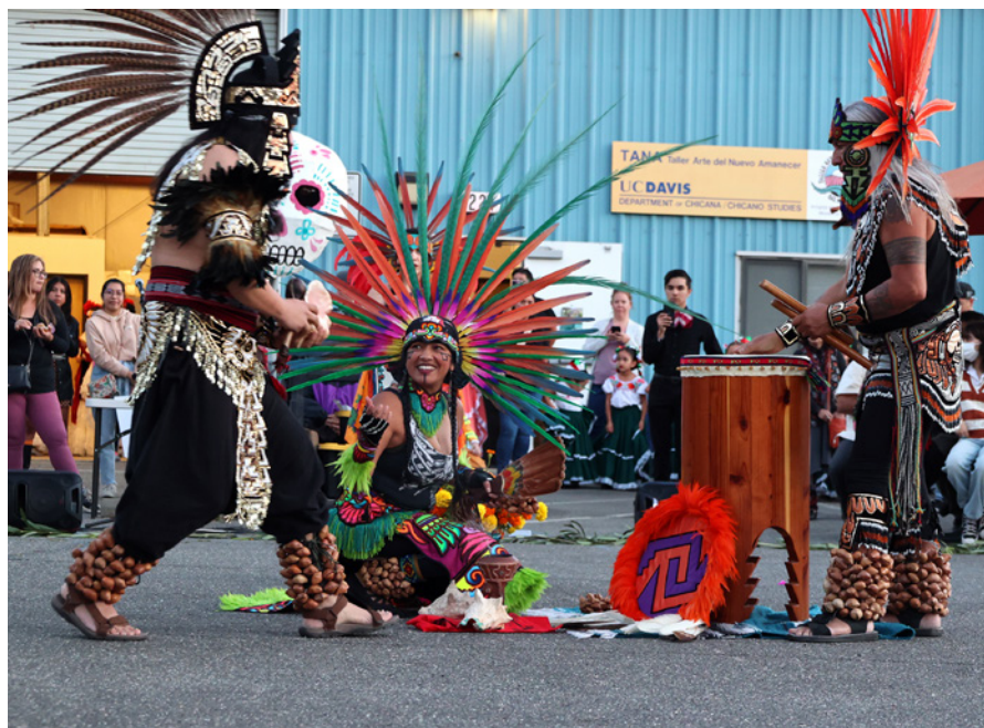
Día de Muertos Celebration, 2022.

Organized by the Manetti Shrem Museum. Co-sponsored by the Center for Chicanx and Latinx Academic Student Success.