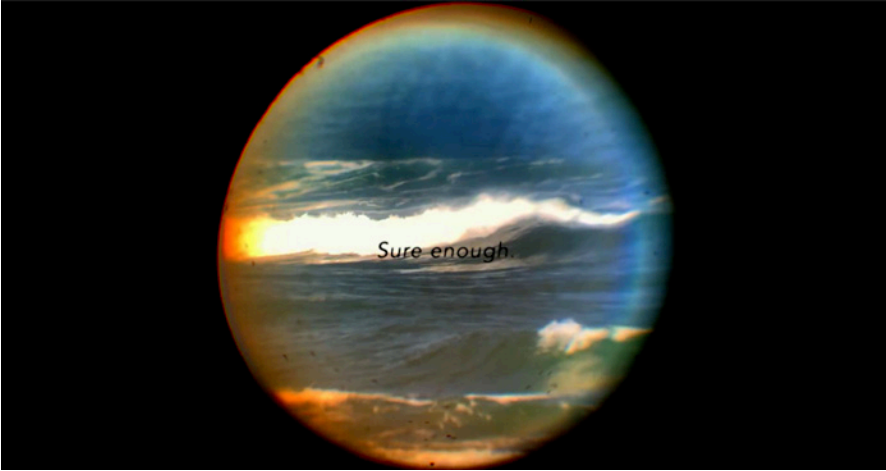
Sky Hopinka, " malni – towards the ocean, towards the shore ," 2020. HD video, stereo, color, 80 min.