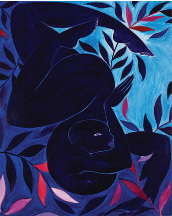
Young, Gifted and Black The Lumpkin-Boccuzzi Family Collection of Contemporary Art Opening July 28, 2022