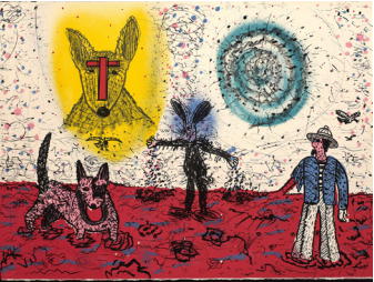
Roy De Forest: Habitats for Travelers Selections from the Manetti Shrem Museum Opening September 25, 2022