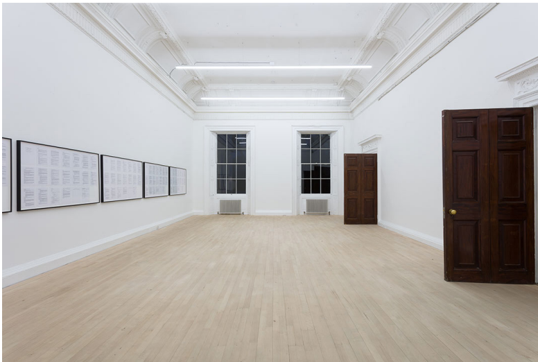
3 & 4 Will IV c. 73, Institute of Contemporary Arts, London, 2020, Installation view.