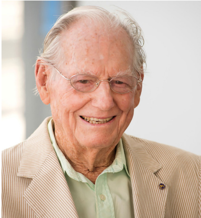
Artist Wayne Thiebaud.

This program is organized by the Manetti Shrem Museum and co-sponsored by the Department of Art and Art History.