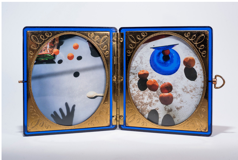
Untitled from Miracle Center . 2019. Pigmented inkjet prints and repurposed frame, 3 1/8 x 6 x 3" (7.9 x 15.2 x 7.6 cm).