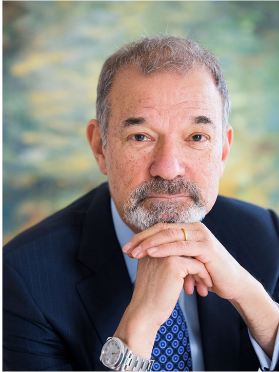
Author Stephen Greenblatt.