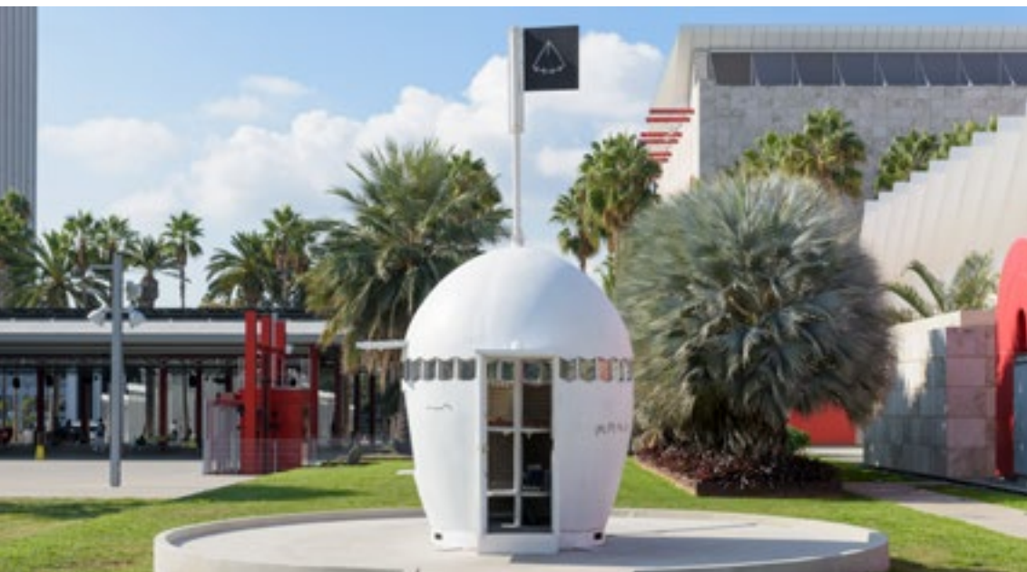
NuMu at LACMA during the exhibition A Universal History of Infamy .

Organized by the Department of Art and Art History. Co-sponsored by the UC Davis College of Letters and Science and the Manetti Shrem Museum.