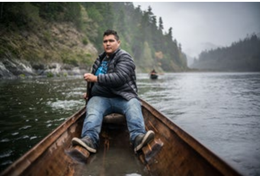
A scene from the film Gather .