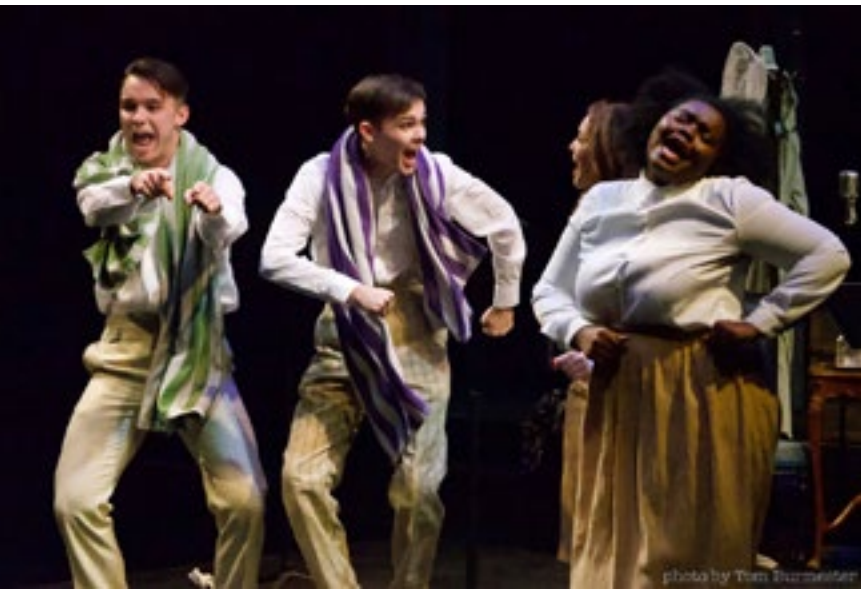
Catalyst: A Theatre Think Tank cultivates new works and new voices.

Welcome to our virtual fall 2020 season! As the museum building remains closed during fall quarter, we're Bringing the Conversation to You through an expansive lineup of museum-presented and co-sponsored public programs.