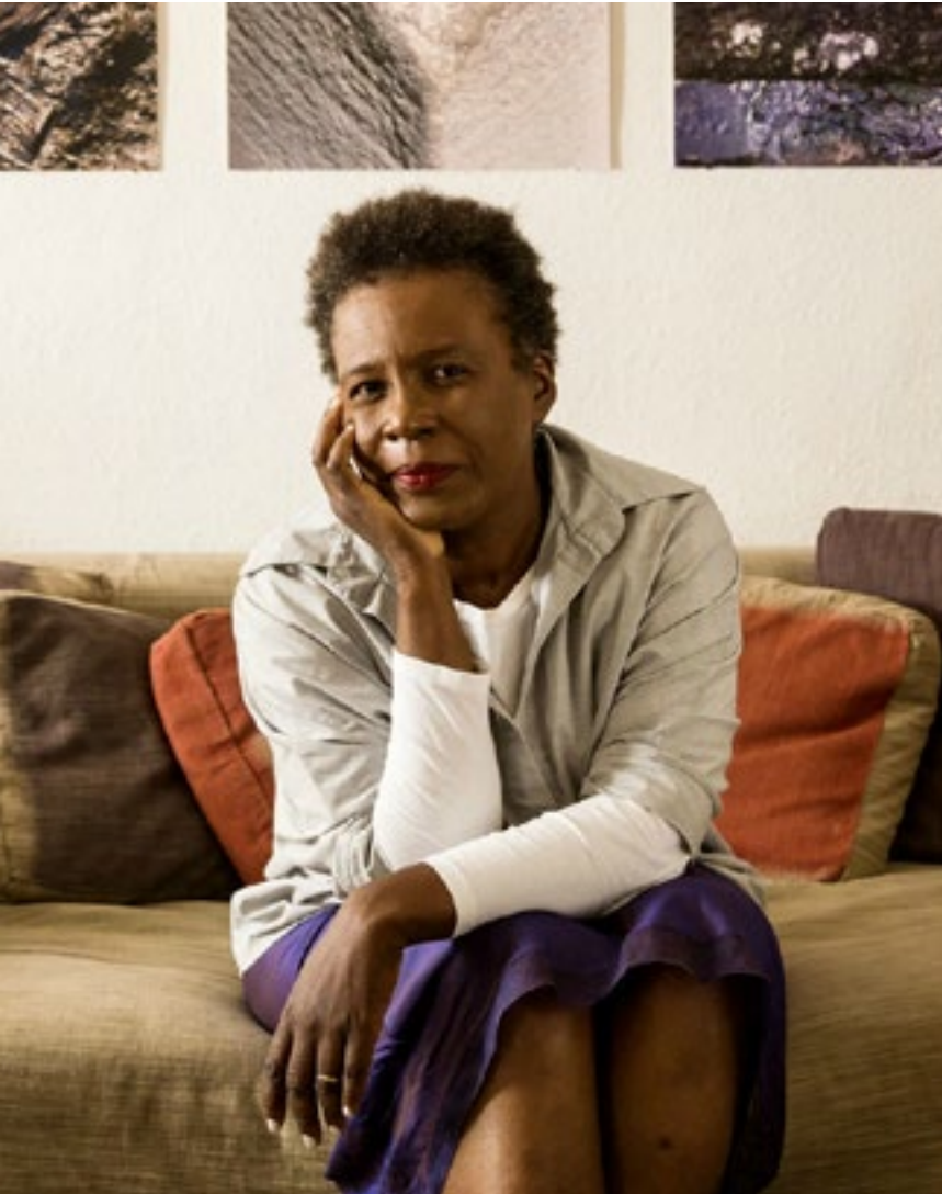
Poet, author and professor Claudia Rankine.

Co-sponsored by Campus Community Relations (Campus Community Book Project and Diversity and Inclusion Education Program); Campus Council on Community and Diversity (CCC&D); Center for African Diaspora Student Success (CADSS); Center for the Advancement of Multicultural Perspective on Social Science, Arts, and Humanities (CAMPSSAH); Cultural Studies Graduate Group; Department of African American & African Studies; Department of American Studies; Department of Art & Art History; Department of Comparative Literature; Department of English and Creative Writing Program; Department of History; Department of Political Science; Department of Religious Studies; Feminist Research Institute; Imagining America: Artists and Scholars in Public Life Public Scholarship and Engagement; Transformative Justice in Education (TJE) Center; School of Education; UC Davis African Continuum; UC Davis College of Letters and Science; UC Davis Humanities Institute; UC Davis Library; UC Davis School of Law; VC - Office for Diversity, Equity, and Inclusion (VC-DEI)