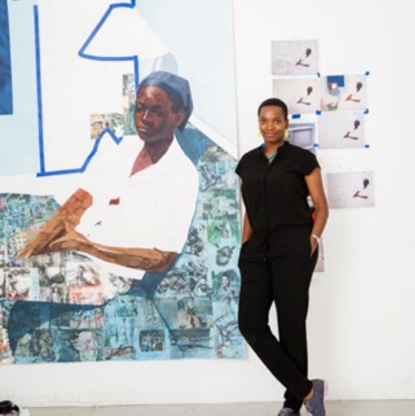
Artist Njideka Akunyili Crosby.