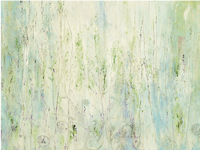
Detail: Nature Revisited 44 , 2018, acrylic on canvas, 84 x 42 in. Private Collection.