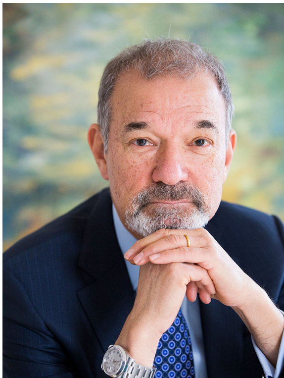
Author Stephen Greenblatt.