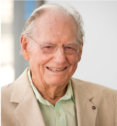
Artist Wayne Thiebaud.

This program is organized by the Manetti Shrem Museum and co-sponsored by the Department of Art and Art History.