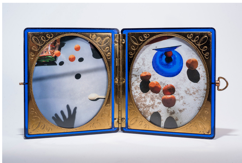
Untitled from Miracle Center . 2019. Pigmented inkjet prints and repurposed frame, 3 1/8 x 6 x 3" (7.9 x 15.2 x 7.6 cm).