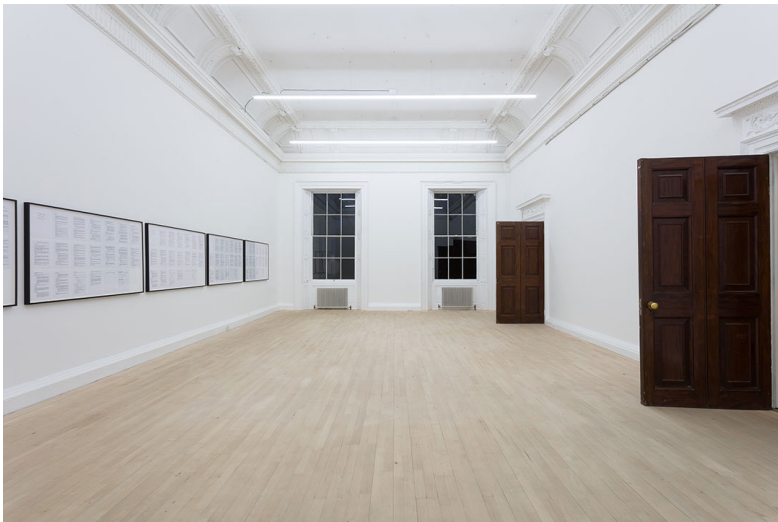
3 & 4 Will IV c. 73, Institute of Contemporary Arts, London, 2020, Installation view.