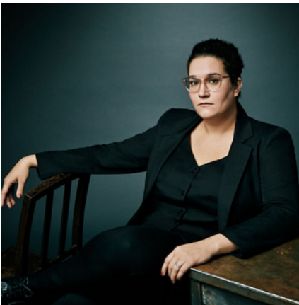
Author Carmen Machado.